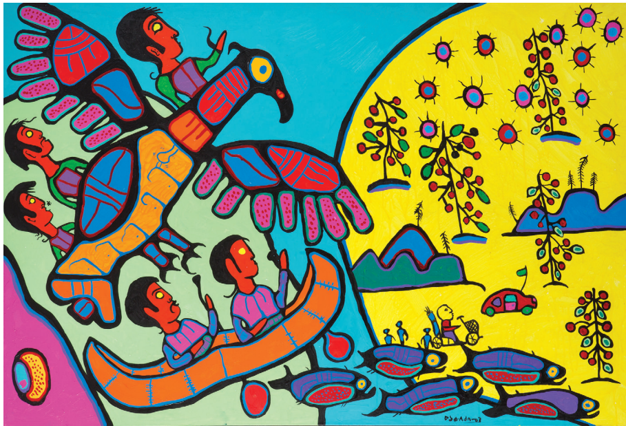
Norval Morrisseau, Thunderbird and Canoe in Flight, Norval on Scooter , 1997, acrylic on canvas, 106.68 x 157.48 cm, Westerkirk Works of Art.