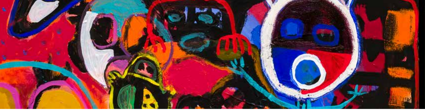
Jane Ash Poitras, Screaming Shaman series (detail), 1994, oil, mixed media. The Mendel Art Gallery Collection at Remai Modern. Purchased with support from the Canada Council's Acquisition Assistance Program, 1996.