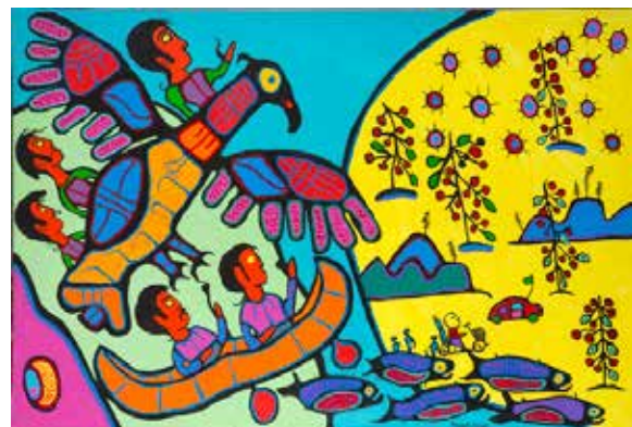
Norval Morrisseau, Thunderbird and Canoe in Flight , Norval on Scooter , 1997, acrylic on canvas, 106.68 x 157.48 cm, Westerkirk Works of Art.

Saskatoon's Remai Modern and Regina's MacKenzie Art Gallery are the largest arts institutions in the province. Both hold significant collections of artworks and strive to make them accessible to Saskatchewan students, regardless of where they live and go to school. The MacKenzie and Remai Modern provide students with experiences that stimulate curiosity, challenge stereotypes, encourage critical thinking and reflection, and contribute to their understanding of the world around them.