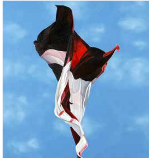
David Garneau, Canadian Flag/Flower , 2005, oil on canvas. Collection of the MacKenzie Art Gallery, purchased with the financial support of the Canada Council for the Arts Acquisition Assistance Program.

Please ensure you are in a space that includes a webcam and microphone. Program Guides at MacKenzie Art Gallery and Remai Modern will be able to virtually come to into your classroom and work directly with students. Basic materials needed are simple drawing materials including paper, pencils and markers.