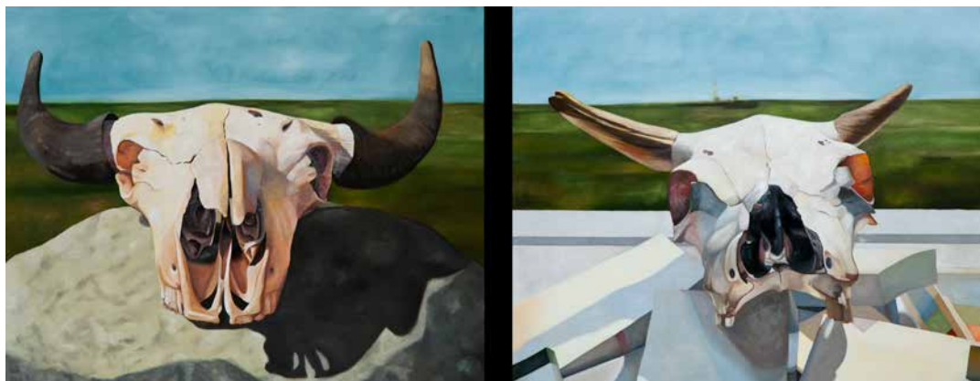
Above: Sherry Farrell Racette, Apparition: October 3, 1885, 1992 , gouache on card, 78.60 x 35.50 cm. Collection of the MacKenzie Art Gallery, purchased with the financial support of the Canada Council for the Arts Acquisition Assistance Program.